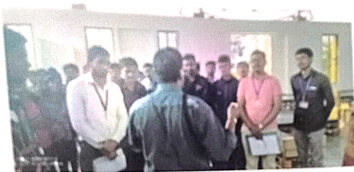
Plant Guide Giving Valuable Information To Students